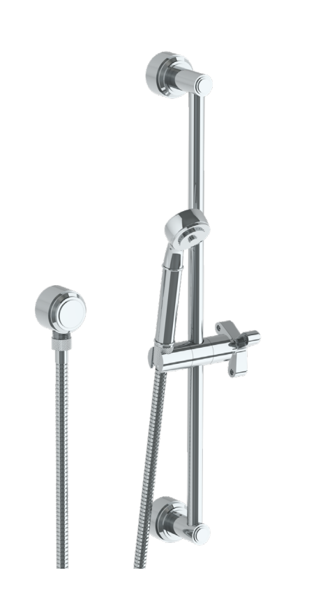
Available in all finishes shown on the Watermark Designs website